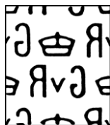
GvR watermark

The labels were printed by photogravure in green ink in the same colour as the then current halfpenny definitive stamp and the amount of ink was intended to be exactly the same as on the definitive to best simulate one, possibly following problems with the previous St Andrew's Cross design.