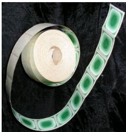
An almost complete roll of 960 poached eggs, but sadly missing its unprinted leader