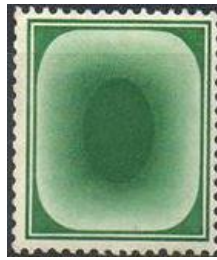
The so-called "Stamp Sensation"

'Target Design' is the term mainly used by the GPO to describe this label. Few collectors gave it this terminology, though, as 'Poached Eggs' gained almost universal acceptance after the initial plethora of names, so is the term used within this article. The GPO did, eventually, succumb to the collector term and talked of poached eggs in official documentation.