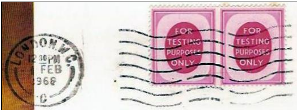
...and an enlargement of the label and postal marking area