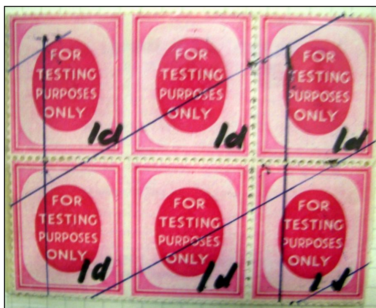
A dummy 1d stamp pane of six labels – the largest multiple known. Note that the pane is actually one and a half labels wide and that the far right double-width label has been cut in half vertically.

The album page write-up records: “The essay comprises a 6/- December 1967 Advertisers’ Voucher Copy (AVC) with four panes of “Scout” commemorative coil testing stamps marked 4d or 1d as dummy booklet panes. The second 1d pane attached to the final interleaf has been unstuck.”