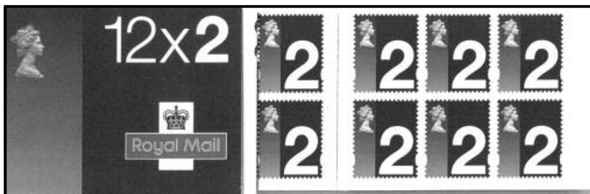
12 x 2nd-class trial booklet and part of the opened book showing the stamp layout

There is one further development that had been proposed at the time of the revamp that never came to fruition. It was clearly the most radical feature and would have resulted in a new definitive design for the first time in almost forty years.