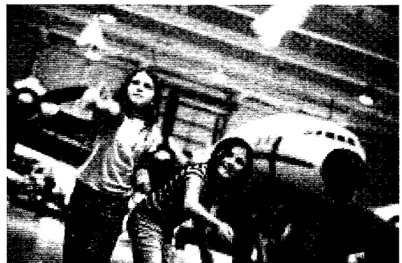
Children inside the current facility with aircraft in background